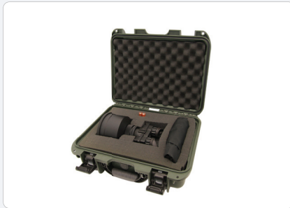
NVS 7 / NV 66-G2 Binocular 8x Hard Case