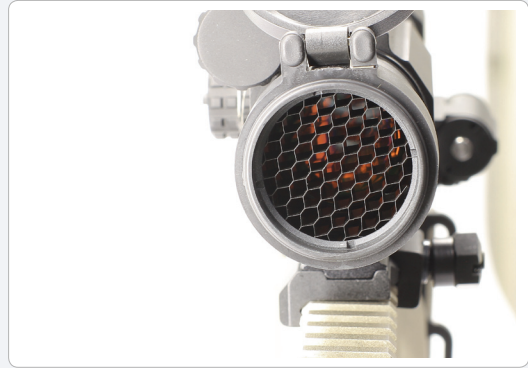
Anti Reflection Filter