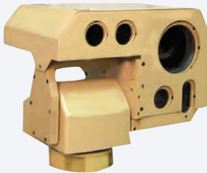
Typical use of LRF MICRO (1550) CI