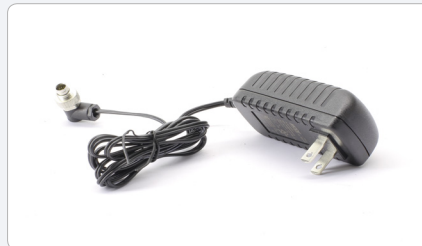
LRF AC/DC Adapter