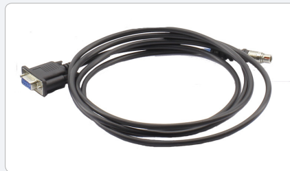
LRF GPS Cable