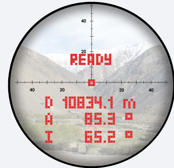
LRB 12K - Display

The LRB 12K is built to outperform any handheld laser rangefinder binocular available today. Packing a virtually endless set of performance features into a MIL-SPEC form factor, the LRB 12K can handle anything professional operators can throw its way. A 12,000 metre (NATO target) measuring range, built-in digital magnetic compass, built-in GPS receiver, and a crystal-clear LED display are combined into an invaluable force multiplier. The LRB 12K requires virtually no maintenance and very little operational training. Through USB and RS-232 interfaces, the LRB 12K can be operated remotely, have its stored data exported, and communicate with external GPS systems and ballistic computers.