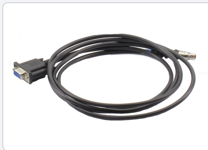
LRF GPS Cable