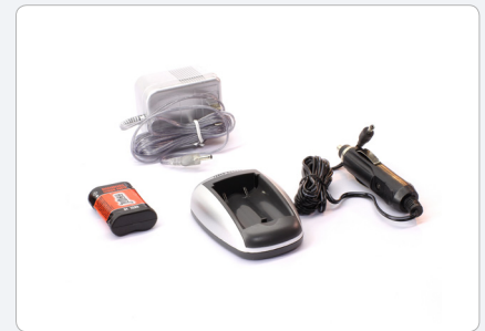
LRB 6/12K Rechargeable Kit