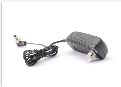
LRF AC/DC Adapter