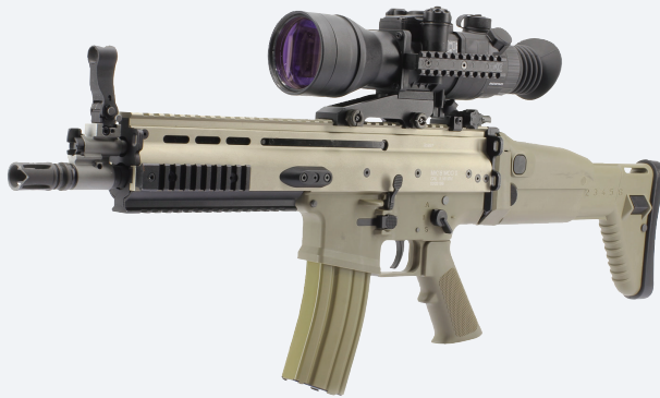
Mounted on Scar Rifle