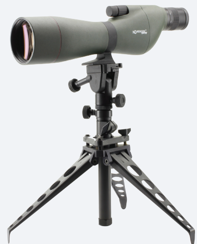
Shown with optional NC SST3-3S Tripod