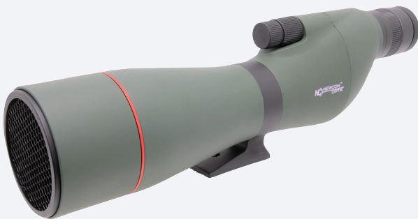
Shown with ARF Filter