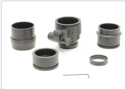
NVS U Coupler Set