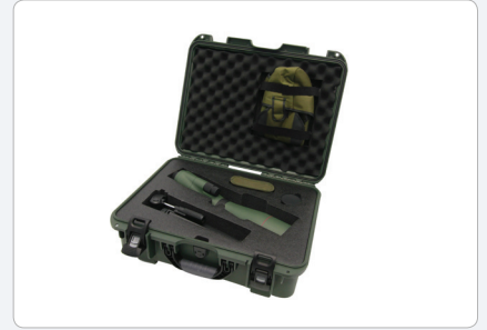
SPOTTER ED Hard Case