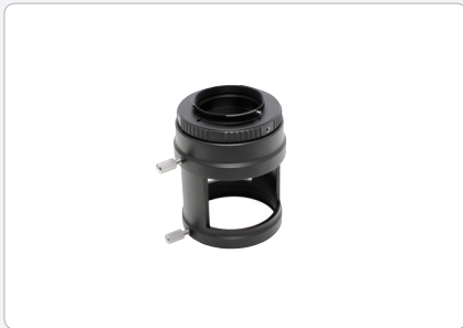
Camera Video Adapter