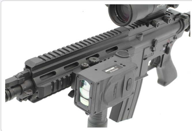
Mounted on Assault Rifle with visible LCD Display