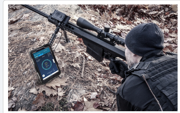
Seeker M mounted on a sniper rifle with a connection to Android™ Compatible Tablet, using NC Cronus™ app.

The SEEKER M is a specially designed multi-purpose mountable laser rangefinder which can be a vital tool for various operations. This device can be mounted and aligned with any optical system including weapon sights and can be integrated with various purpose built platforms. The device incorporates the newest laser ranging technologies to help the operator not only seek the target, but also, based on compass and inclinometer indications, receive precise GPS coordinates of the target's location.