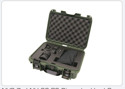
NVS 7 / NV 66-G2 Binocular Hard Case