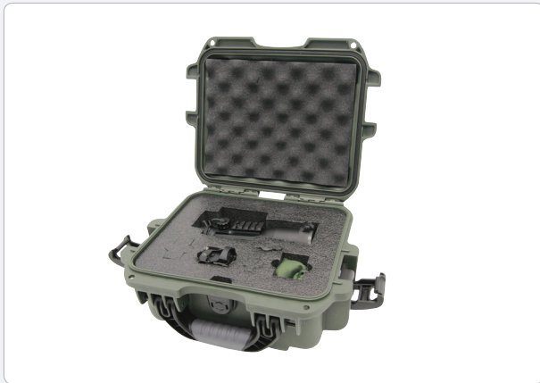
NC 6x50 Hard Case