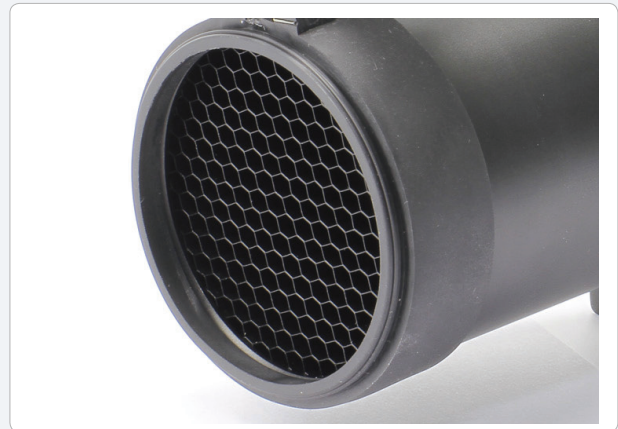
Anti - Reflective Filter