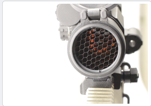
Anti Reflection Filter