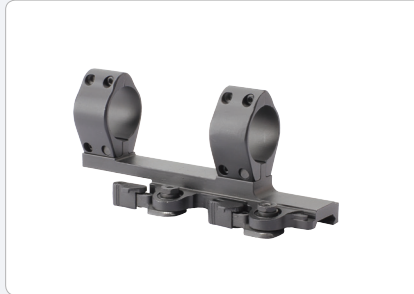
QR Mount (30mm)