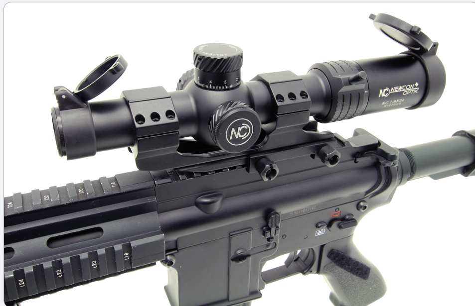
Mounted on Rifle