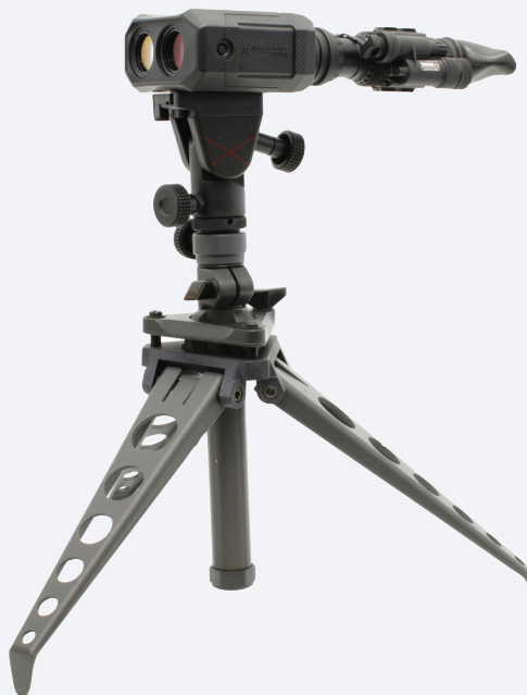
Shown in night vision configuration