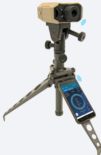
Shown in active bluetooth mode