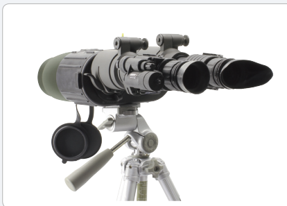
Night Vision Capability

LRB 6000CI LONG RANGE LASER RANGEFINDER BINOCULAR