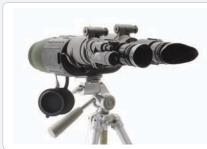
Night Vision Capability