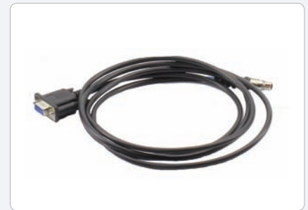
LRF GPS Cable