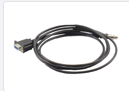
LRF GPS Cable