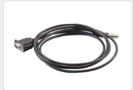
LRF GPS Cable