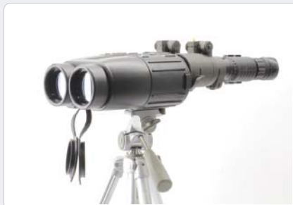
Night Vision Capability