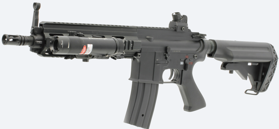
Mounted on H&K 416 Assault Rifle

105 Sparks Ave., Toronto, ON, M2H 2S5 Canada newconsales@newcon-optik.com, www.newcon-optik.com