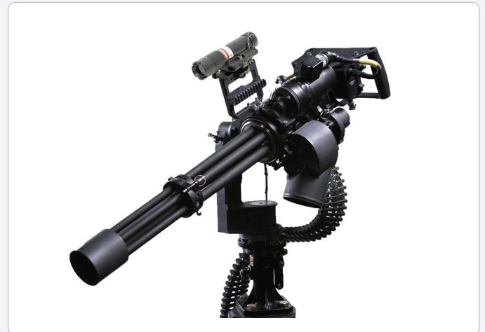
Mounted on M134 Minigun