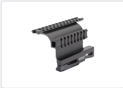
NVS Side Mount