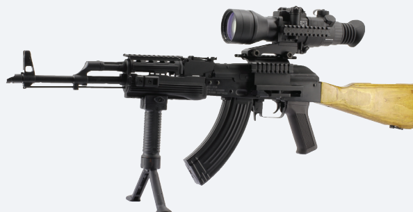
Mounted on AK Rifle using Side Mount