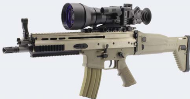
Mounted on Scar Rifle