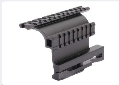
NVS Side Mount