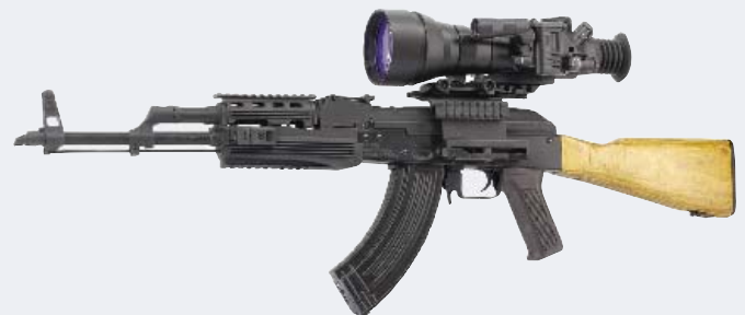
Mounted on AK Rifle using Side Mount