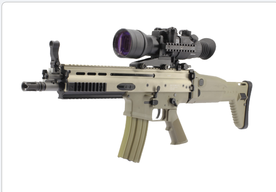
Mounted on Scar Rifle