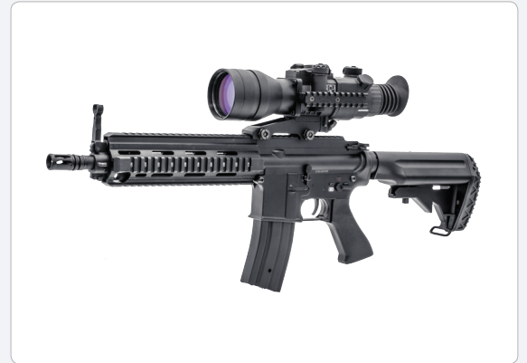
Mounted on AR-15