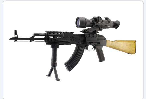
Mounted on AK Rifle using Side Mount

105 Sparks Ave., Toronto, ON, M2H 2S5 Canada