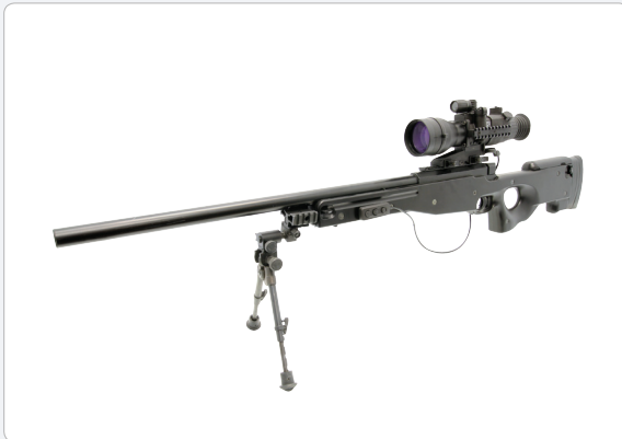
Mounted on .50 Cal Sniper Rifle