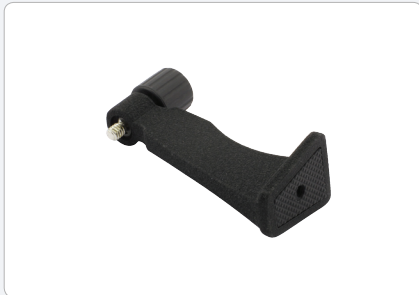
ATA - Tripod Adapter